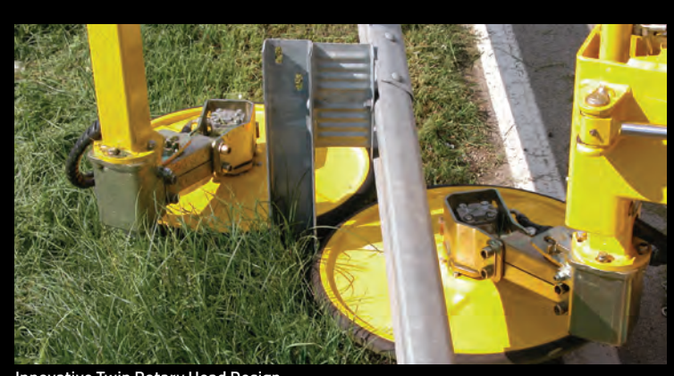
Innovative Twin Rotary Head Design