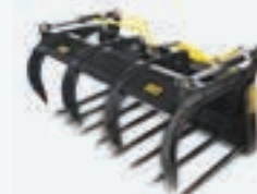
Heavy duty muck grab