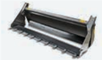
4 in 1 bucket